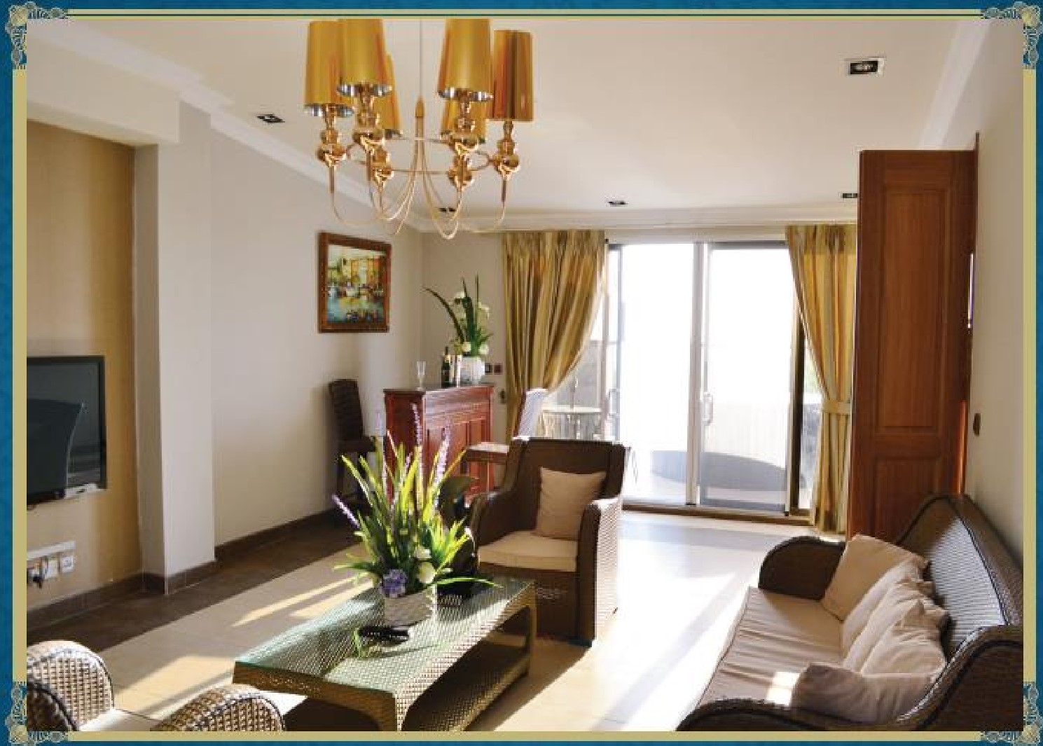
The Penthouses comes with a Touch of Contemporary Classic design