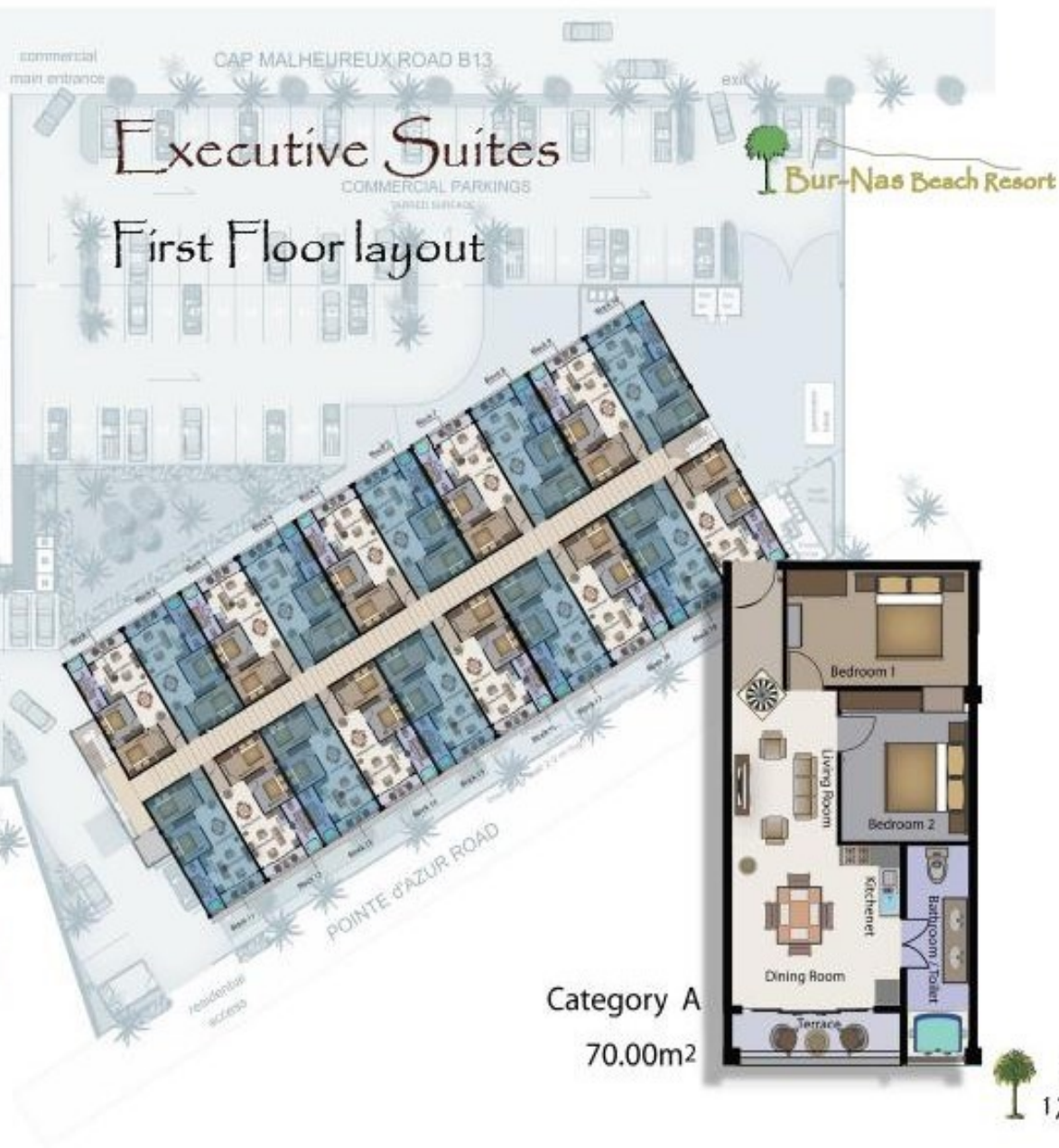
Category A 70.00m 2