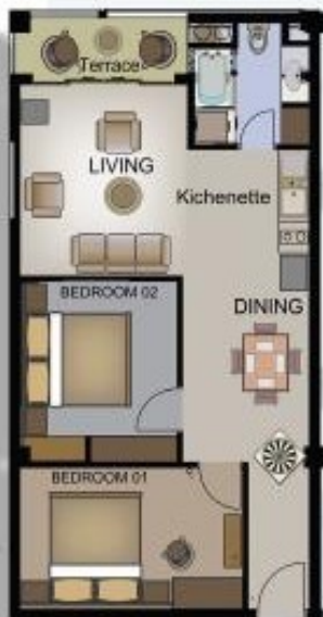
Category B 70.00m 2